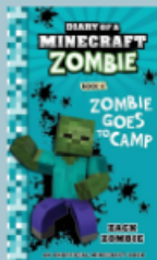
Top Children's Book